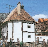
3 haus wortgasse