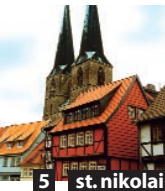
5 st. nikolai